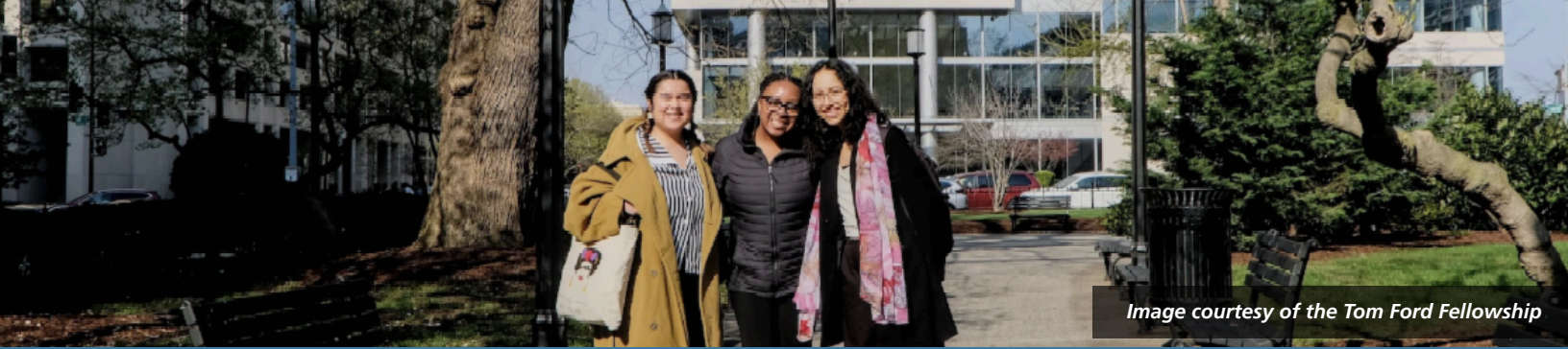
Image courtesy of the Tom Ford Fellowship